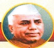
Hon. Yashwantrao Chavansaheb Founder