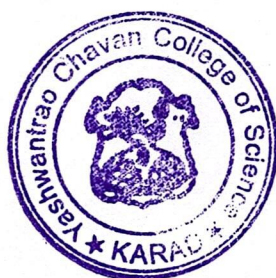
Principal Yashwantrao Chavan College of Science, Karad